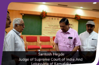
Santosh Hegde Judge of Supreme Court of India And Lokayukta of Karnataka