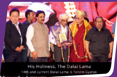
His Holiness, The Dalai Lama 14th and current Dalai Lama is Tenzin Gyatso