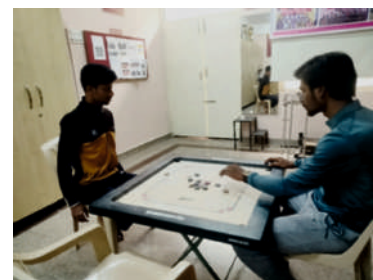
Carrom (Men) Inter Class Competition 2025