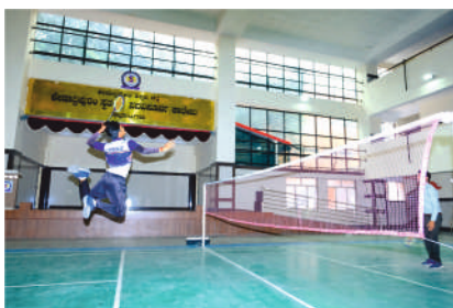
Badminton (Men/Women) Inter Class Competition 2025