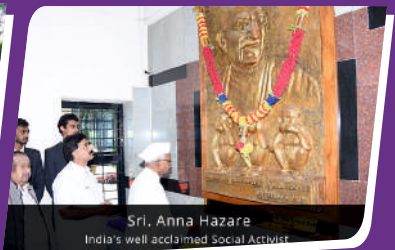
Sri. Anna Hazare India's well acclaimed Social Activist