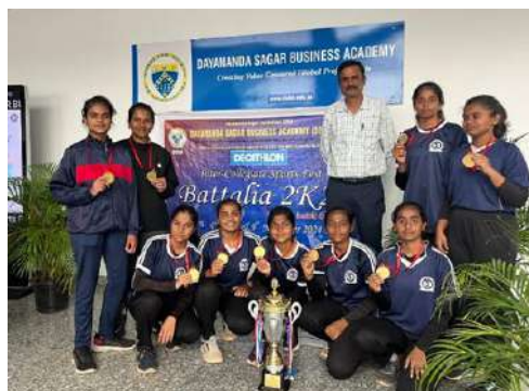
Dayananda Sagar Business Academy Intercollegiate Sports Fest Throw Ball (Women)