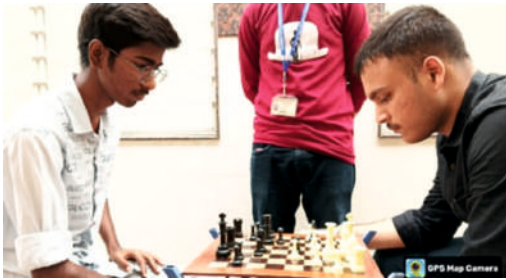
Chess Inter Class Competition 2024-25