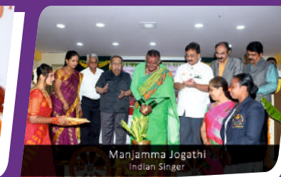
Manjamma Jogathi Indian Singer