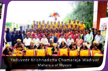
Yaduveer Krishnadatta Chamaraja Wadiyar Maharaja of Mysore