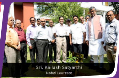
Sri. Kailash Satyarthi Nobel Laureate