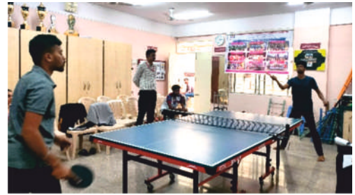
Table Tennis (Men/Women) Inter Class Competition 2024-25